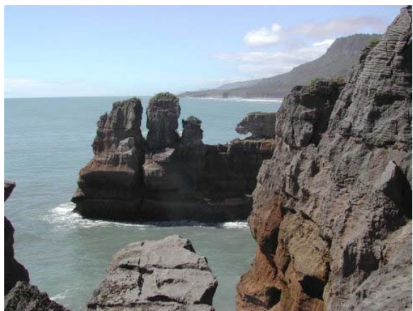
More West Coast - Pancake Rocks

We planned to visit Invercargill and Bluff (southern most point to the South Island), but threatening skies made us head east to Dunedin before heading north. I did not make motel reservations for the East Coast thinking that with more population ---it would be easy to find a motel. Wrong! Dunedin is a University town and school just resumed. So no rooms – we finally found a place one hour north in Palmerston and within an easy walk of a fine local tavern. Great Beer!