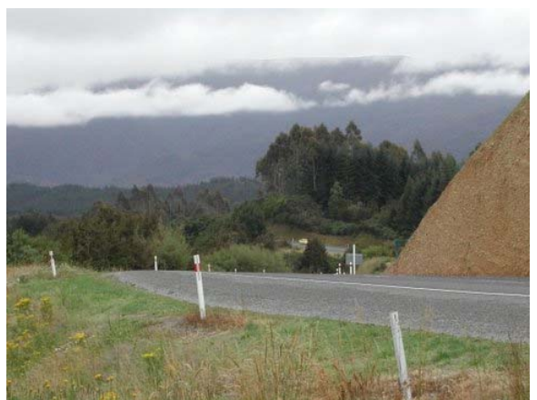
Highway 6 to the West Coast of the South Island

On Sunday, Feb 10 we headed off for the West Coast, but not before more wonderful twisty mountain roads which challenge ones riding skills.