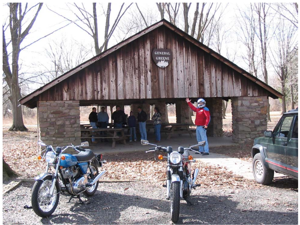
March 2004 – Washington Crossing Historical Park – yours truly – Editor