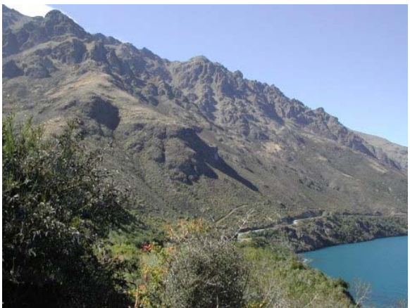
Arid west side of Southern Alps - south of Queenstown

We planned to visit Invercargill and Bluff (southern most point to the South Island), but threatening skies made us head east to Dunedin before heading north. I did not make motel reservations for the East Coast thinking that with more population ---it would be easy to find a motel. Wrong! Dunedin is a University town and school just resumed. So no rooms – we finally found a place one hour north in Palmerston and within an easy walk of a fine local tavern. Great Beer!