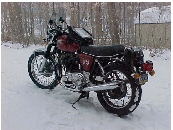
Cabin Fever – February '07 (Nicholas Lutwyche)