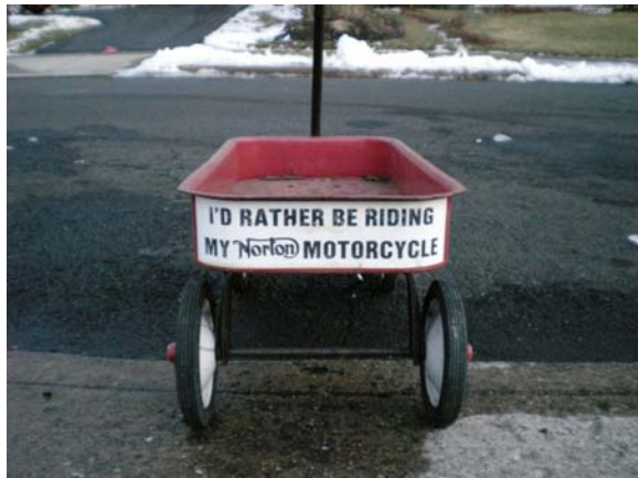
Pretty much says it all!

So let's do a recap of the past three club meetings so far this year.