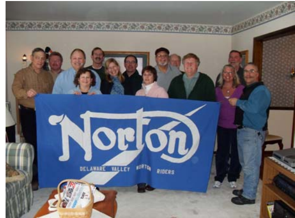
Celebrating 25 years of good times. Cheers!