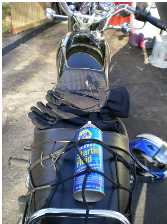
Another view - never leave home without it!

Scribe Richard was off-site somewhere having fun so Kathy Gehhardt volunteered to perform the documentation duties and offers the following observations.