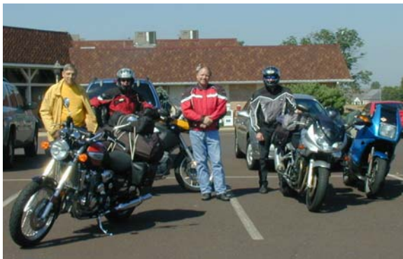
Modern day Merry Pranksters?

Charlotte snapped a photo as we prepared to depart after eating our fair share.