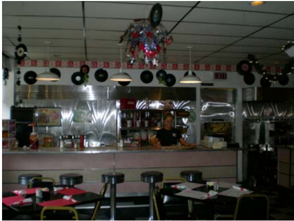
Yesterday's Restaurant, Renovo