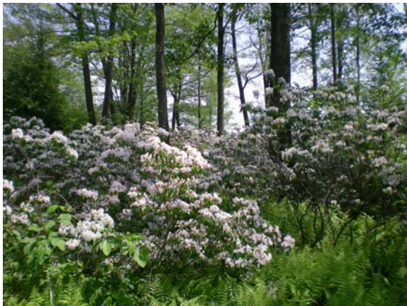
Mountain Laurel in full bloom – down the road from the Fin Fur & Feather