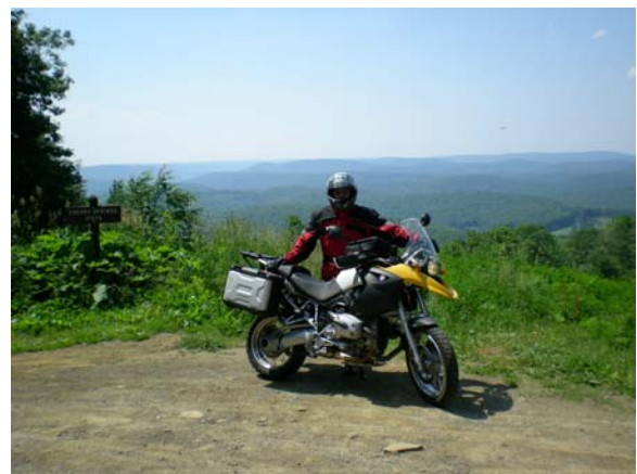
Cherry Springs Vista – Riverside Route