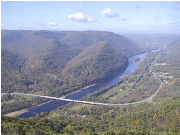
view from Hyner View facing upstream of West Branch of the Susquehanna River toward Renovo

The overlook is very popular with hang-gliders - must be quite the view looking straight down from under your wings.