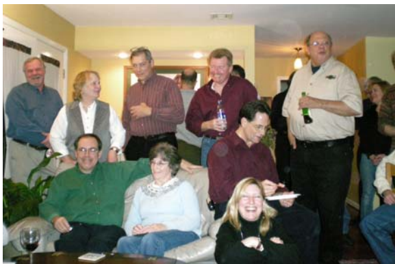
Chinese Auction action