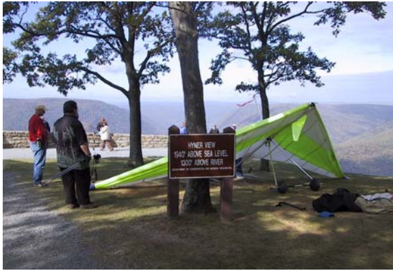
Hang gliding at Hyner View

It is a challenging as well as extremely scenic ride. You don't want to run off this road! At the bottom, you turn left into Hyner View State Park and follow the narrow, twisty road to the top of the overlook which is 1,940 feet above sea level and 1,300 feet above the river below.