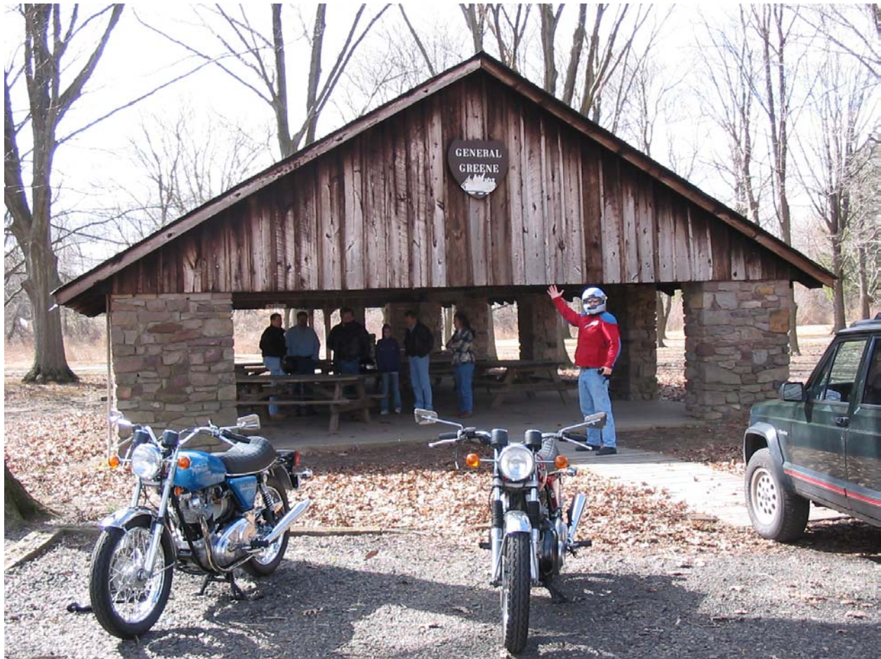
March 2004 – Washington Crossing Historical Park – yours truly – Editor