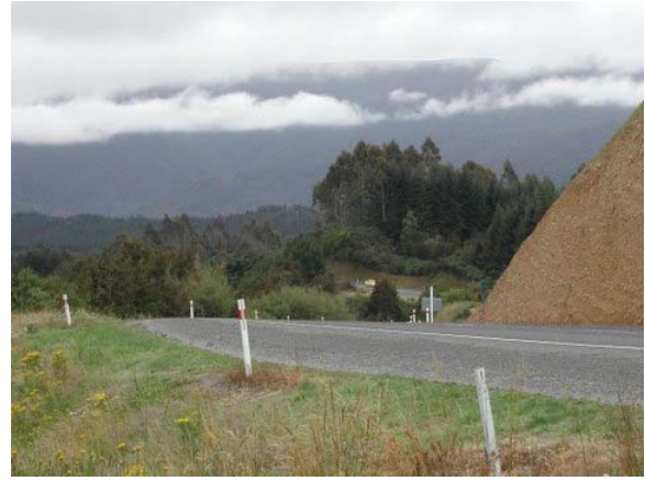
Highway 6 to the West Coast of the South Island

On Sunday, Feb 10 we headed off for the West Coast, but not before more wonderful twisty mountain roads which challenge ones riding skills.