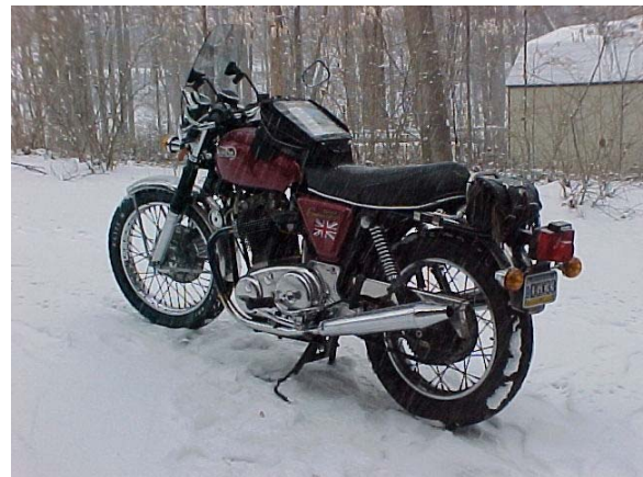
Cabin Fever – February '07 (Nicholas Lutwyche)