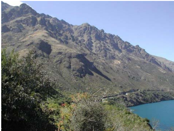
Arid west side of Southern Alps - south of Queenstown

We planned to visit Invercargill and Bluff (southern most point to the South Island), but threatening skies made us head east to Dunedin before heading north. I did not make motel reservations for the East Coast thinking that with more population ---it would be easy to find a motel. Wrong! Dunedin is a University town and school just resumed. So no rooms – we finally found a place one hour north in Palmerston and within an easy walk of a fine local tavern. Great Beer!