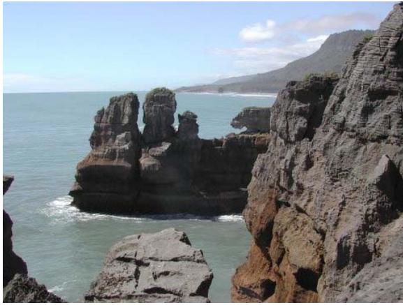
More West Coast - Pancake Rocks

We planned to visit Invercargill and Bluff (southern most point to the South Island), but threatening skies made us head east to Dunedin before heading north. I did not make motel reservations for the East Coast thinking that with more population ---it would be easy to find a motel. Wrong! Dunedin is a University town and school just resumed. So no rooms – we finally found a place one hour north in Palmerston and within an easy walk of a fine local tavern. Great Beer!