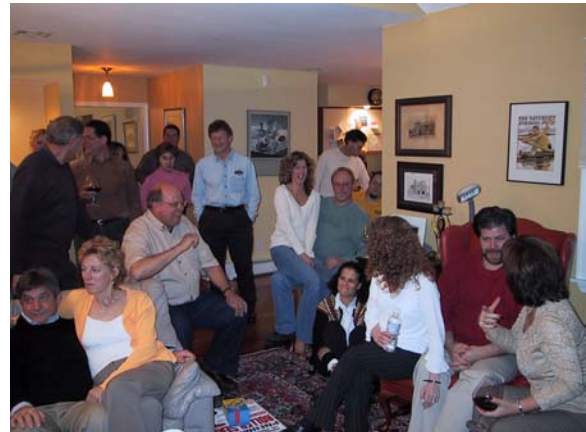
Nortoneers doing what Nortoneers do best!

Regardless of your choice in clothing, everyone had a hoot and vowed to return next year!