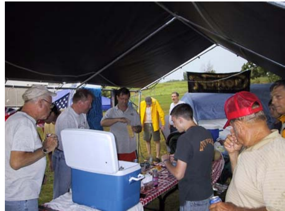
Post storm impromptu dinner – cheese, crackers and beer – not bad at all