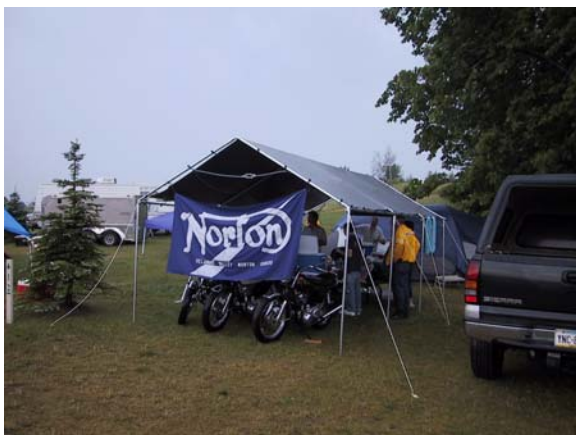
DVNR Headquarters, Mancelona, MI