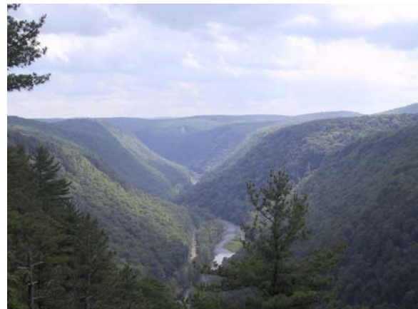
Pine Creek Gorge aka PA Grand Canyon

Wellsboro is the prettiest town in Pennsylvania. I know that is saying a lot but if you haven't been there you need to avail yourself. And if you enjoy natural beauty there's the Pennsylvania Grand Canyon right down the road to the west – again, if you haven't been there, go and enjoy.