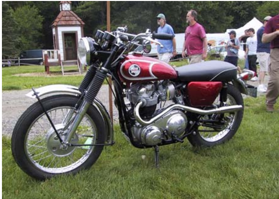
Immaculate Model 15CS (actually a P11)

The last issue of our newsletter incorrectly identified the following Norton photographed at Butler's Orchard in May as a Model 15CS. Indeed, the machine in the photo is a model P11.