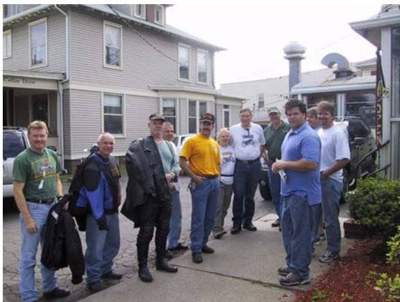
Post breakfast ad hoc meeting outside the famous Wellsboro Diner – Sat am

Our spring weekend rally in Wellsboro late June was well attended.