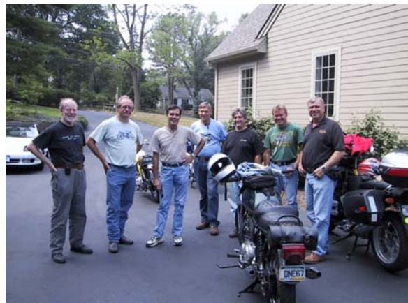
August meeting – official club greeters