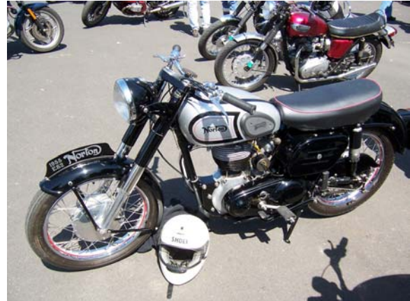
1955 ES2 Norton single

How often do you see three fastbacks in one place... well, that day you did. And the 'oldest Norton' on hand was the unrestored 1929 CS1 500 Single sitting on a trailer in the parking lot. It was a runner too.