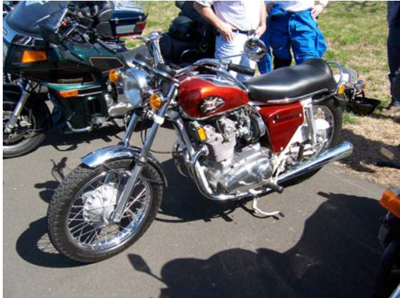
lovely BSA Triple with factory gray frame

It was nice to see the wide range of twin cylinder hardware from other European nations as well with numerous Ducati, Guzzi and BMW models on hand. There was a nice 4-cyl Benelli 500 and a Laverda Triple on deck too.