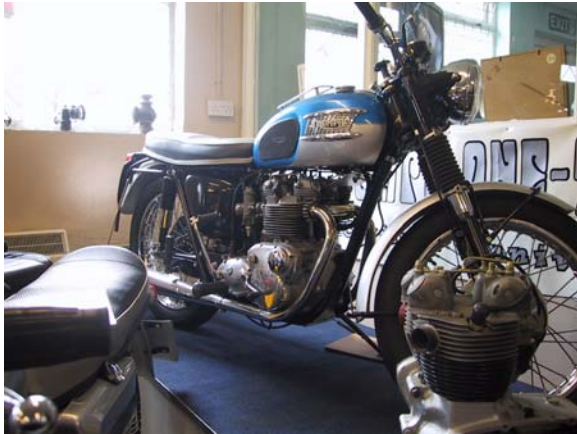
750 triple pre-production – LMC Museum

Sunday April 17 we went to the New Forest on the south coast of England and visited the Sammy Miller Motorcycle Museum. We met the man himself.