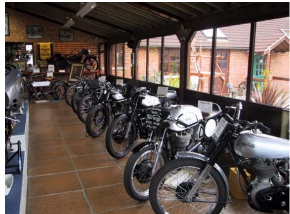
Norton Competition Singles – Miller Museum