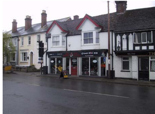
Red Dog - home of Italian Motorcycles

Red Dog Motorcycles is home to Benelli, MV Augusta, CCM, Puch, and Ducati/Cagiva.