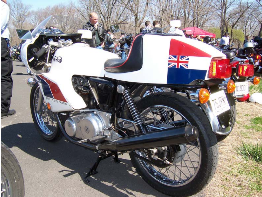
1974 John Player Special

But the real story this date was Norton. There were Fastbacks, 750cc and 850cc Commandos, a 750cc Norton Atlas, a 1955 Norton Dominator wideline frame, a 1947 International overhead cam SS road bike fitted with a Manx head, a John Player Norton and other models proudly parked throughout the parking lot. Many of the Nortons as well as other antique machines were immaculately restored and would have been at home in a museum. But this is not the place for these fine vintage British machines. After all, the motto of the DVNR is "Ride 'em, don't hide 'em".