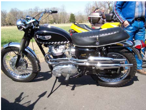
1968 TR6C Trophy Special

What a great selection of machines all gathered in the same corral and it keeps getting better every year.