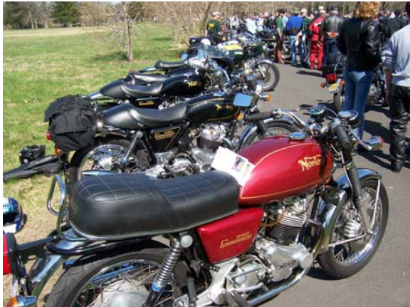
Commando line up

The turn out was as fine as the weather with a record 420 some odd bikes entering the park. Vintage machinery was everywhere with over 40 Nortons resting proudly in their separate area.