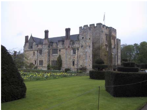
Hever Castle built 1270

We also visited Old London that Friday. There were many modern, large displacement motorbikes running the city streets even though the weather was damp with a chill to the air.