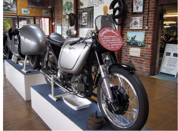
Norton Manx Low Boy – Miller Museum

The Miller Museum is housed in what was at one time an abandoned dairy farm. You would never guess that based upon its current pristine state. And if you are wondering, the interior of the buildings are fully protected from fire by a comprehensive sprinkler system.