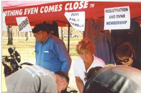
DVNR volunteers hard at work