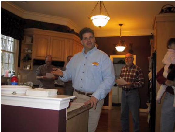
Spending some political capital!

WOW! If this awesome weather doesn't have you excited about the 2005 riding season. Call your doctor and have him check for a pulse!