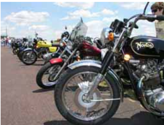
DVNR Nortons line up along the VanSant Runway.

Thanks Bob for introducing us to some really nice roads! If the goal was to cross Route 12 as many times as possible I say we scored a good bakers dozen!