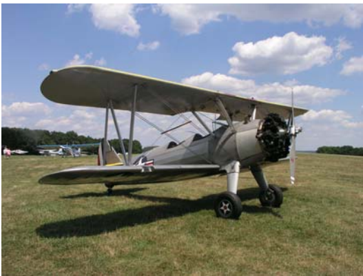
Vintage aircraft and soaring gliders draw many motorcyclists to VanSant Airport in Bucks County, PA.