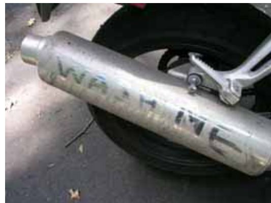
"Wash Me" was all my SuperHawk had to say about the ride!