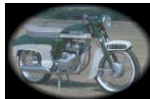
Dreamy early 1960s 350cc Norton Navigator