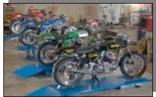
What's your favorite color?

I have attended the Cycle World Motorcycle Show for many years at different locations, but this year I saw something that really pumped me up! On display was a customized Norton Commando VR 880 Sprint Special built in Oregon by an outfit called Vintage Rebuilds.